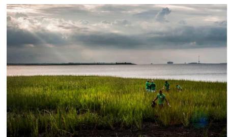
Globemaster III from the 437 th Airlift Wing at Charleston Air Force Base, S.C., performs a combat landing during an incentive flight recently (top). Airmen volunteer to cleanup the marsh at Waterfront Park for trash and debris carried in from the ocean (bottom).